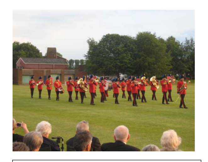
The Corps Band Beat Retreat

A sad occasion and in many ways an honour to be involved in the organisation of this auspicious event even if it did involve turning back the clock and attending, once more, pre-move meetings with that feeling that one had never gone into retirement sixteen years ago.