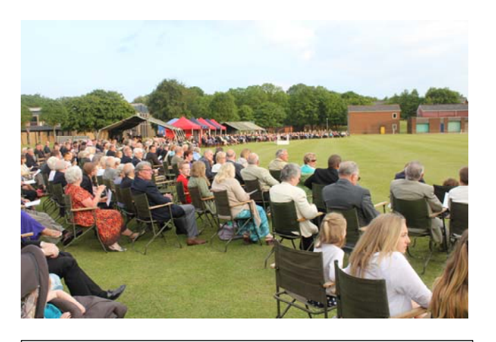
Crowds enjoying the Beat Retreat